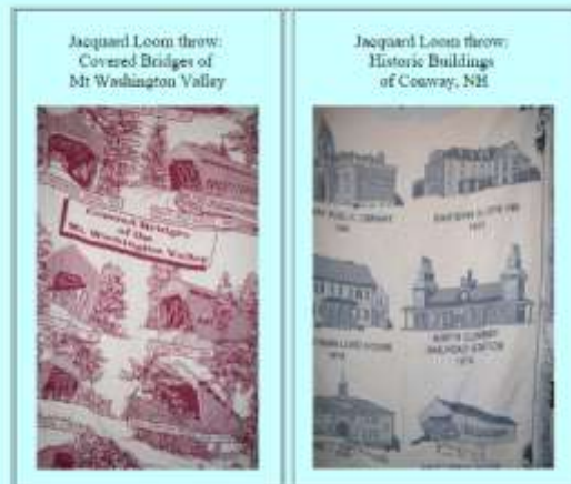
Jacquard Loom throws - 2 designs: Covered Bridges of Mt Washington Valley and Historic Buildings of Conway

250th edition afghan featuring Conway's historic buildings. We also have a wide variety of books, post cards, coffee mugs and other items for sale!