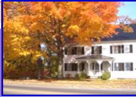
Serving Conway NH since 1935