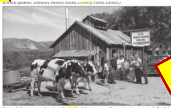
Situated about two-thirds of a mile north of the cemetery, this rustic structure symbolized the important pioneer industry of maple sugar harvesting. Over time, maple gathering technology changed from wooden buckets to metal pails to plastic bags. The building is now home to Emerson