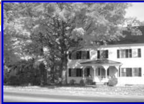
Serving Conway NH since 1935