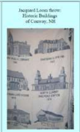
Jacquard Loom throws - 2 designs: Covered Bridges of Mt Washington Valley and Historic Buildings of Conway