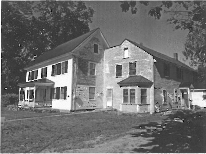
During scraping phase