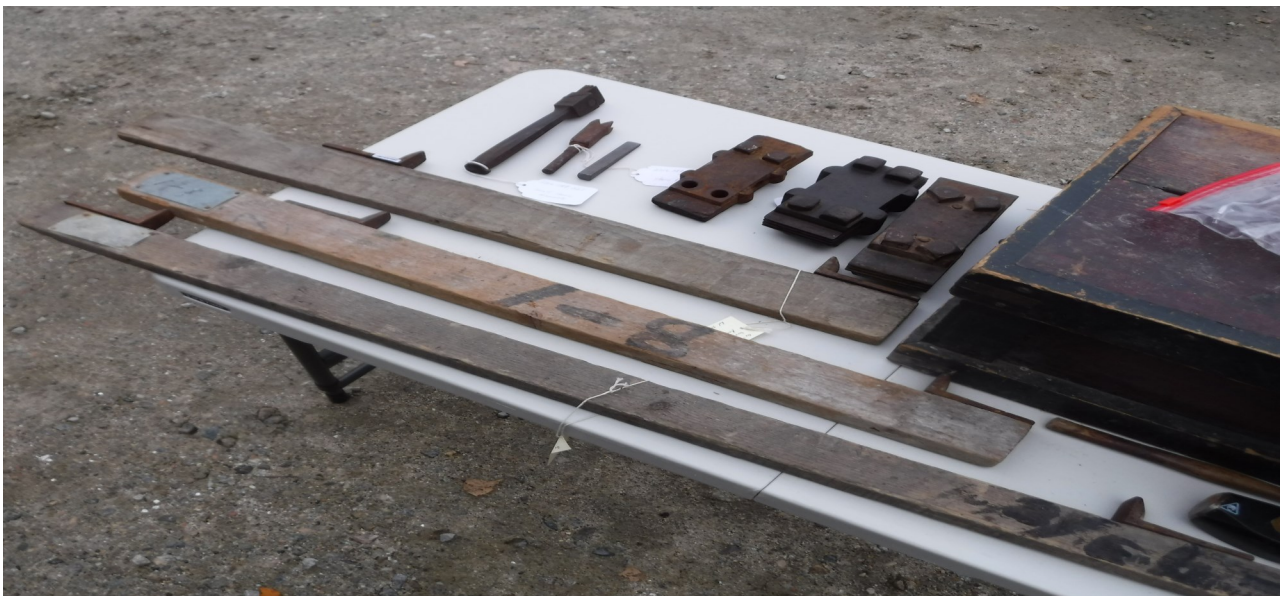
Some of the tools used at the Redstone Quarry from our collection. These were displayed at field trips at the quarry in late October.