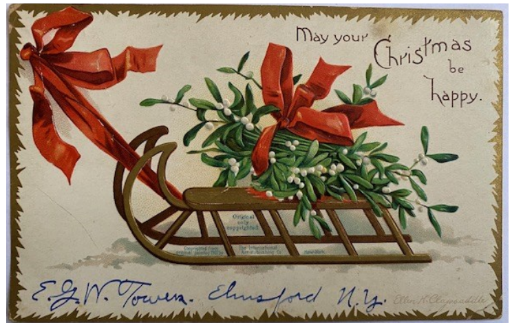
A Christmas postcard in our collection