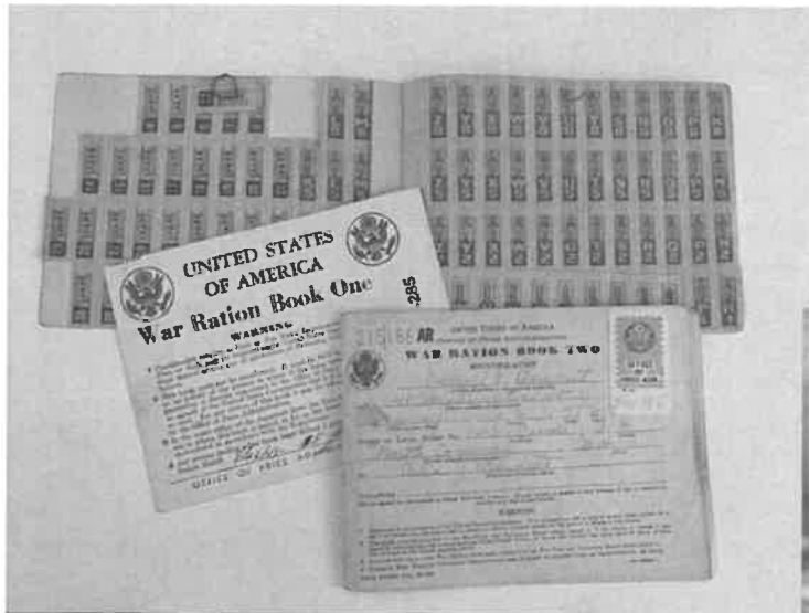
Top left: WWII ration book & stamps from a family on Washington St.

We're taken on the massive undertaking of cataloging our immense collection. In the process, we've come across so many amazing items that we get to play with!