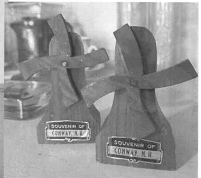
Middle: The famous windmills of Conway...souvenirs of Conway, NH