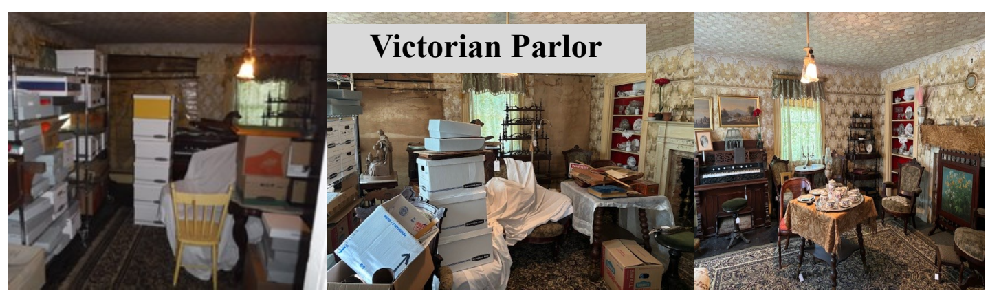
September 2022 September 2024 May 2025