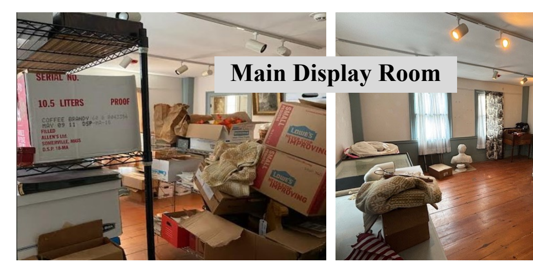
A labyrinth of boxes, September 2023